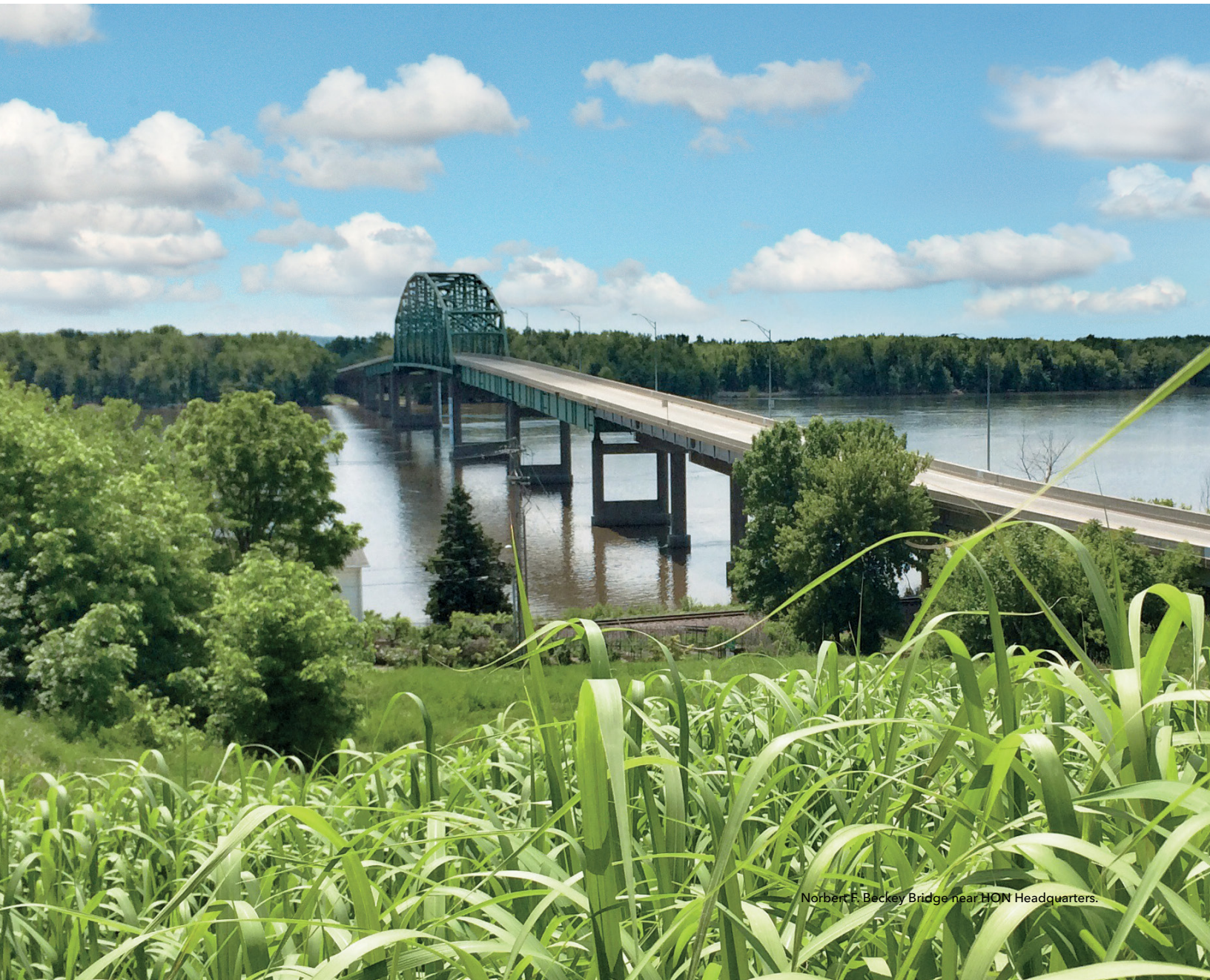
Norbert F. Beckey Bridge near HON Headquarters.

At HON, we take our responsibility to the earth seriously. We take advantage of every step in the product life cycle to minimize our environmental footprint. It starts with designing and manufacturing products that incorporate recycled content whenever possible. We have also significantly reduced the amount of packaging and waste involved in the transportation and installation of our products. It doesn't begin and end with us. We work with our suppliers, dealers and our customers to continually identify areas for environmental improvement. At HON, environmental stewardship is not a new idea, it's at the core of everything we do.